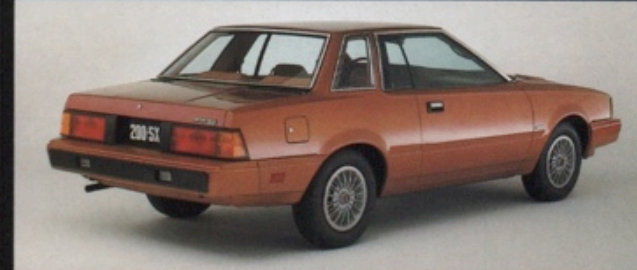
200-SX Hardtop Deluxe