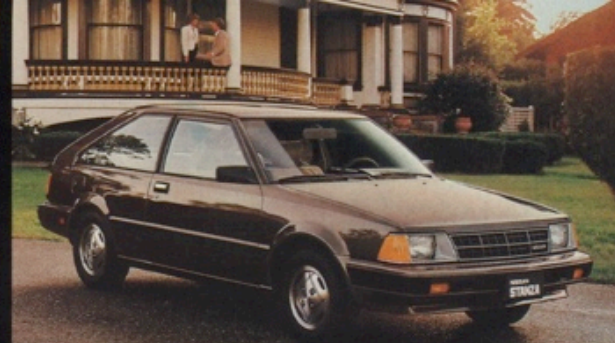
Nissan Stanza 2-Door Sedan XE