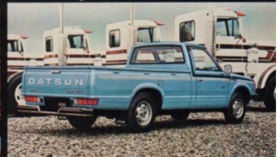
Diesel Long bed