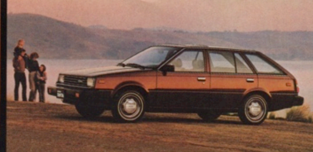
Nissan Sentra Wagon Deluxe