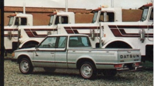
Diesel King Cab