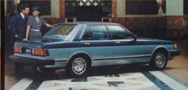
Diesel Maxima Sedan