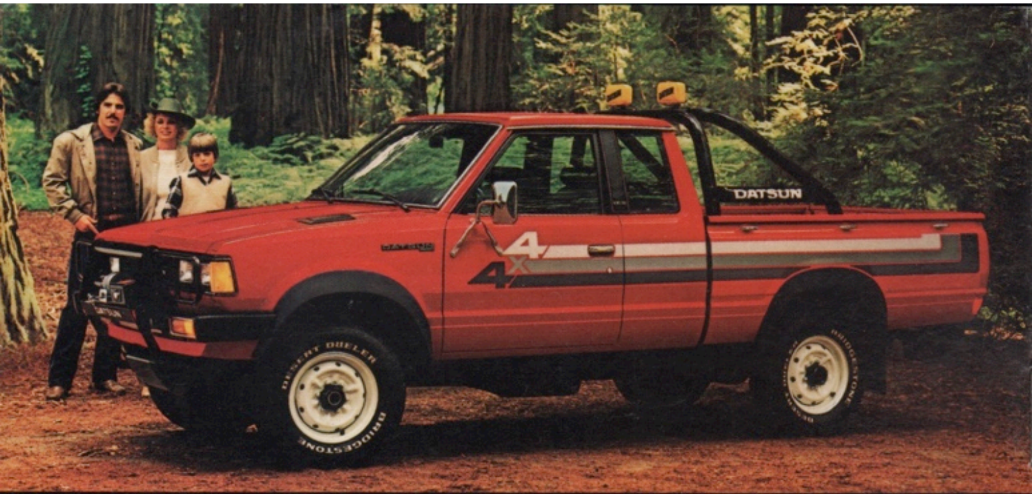
King Cab 4x4