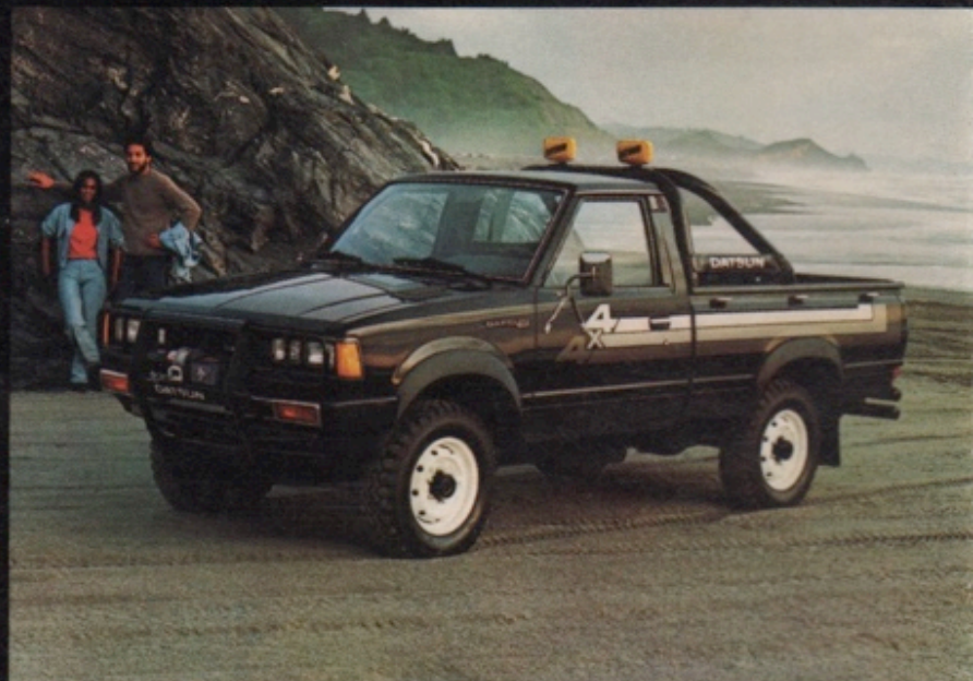
Li'l Hustler 4x4