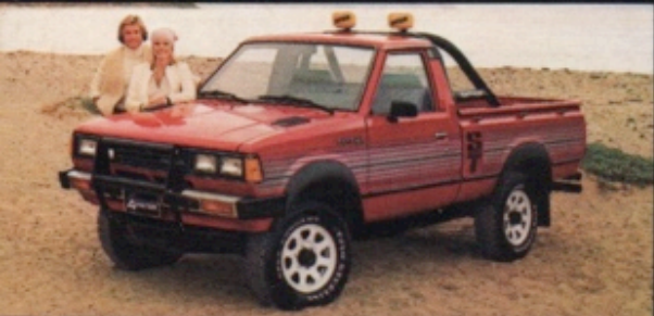
Sports Truck 4x4