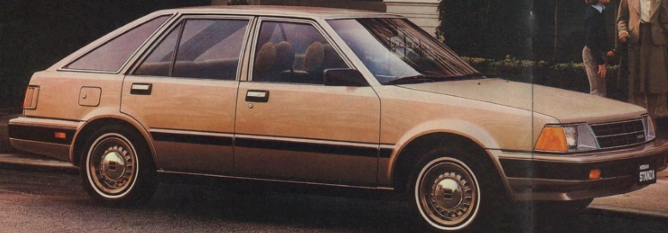
Nissan Stanza 4-Door Sedan XE