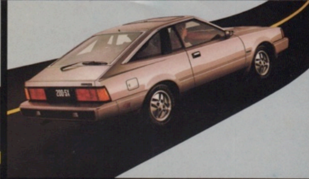
200-SX Hatchback SL