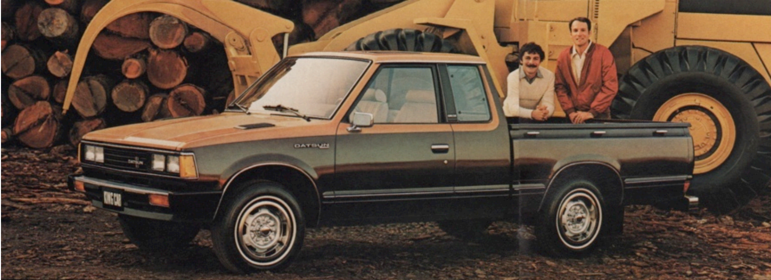
King Cab GL