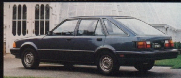
Nissan Stanza 4-Door Sedan Deluxe