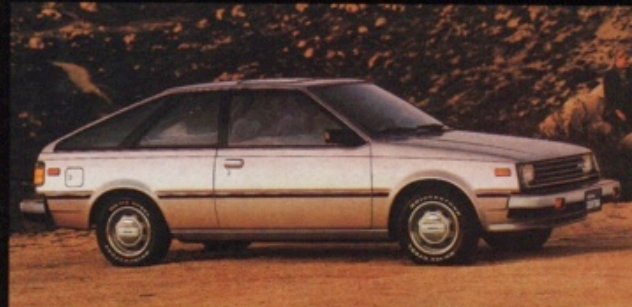
Nissan Sentra Hatchback Coupe XE