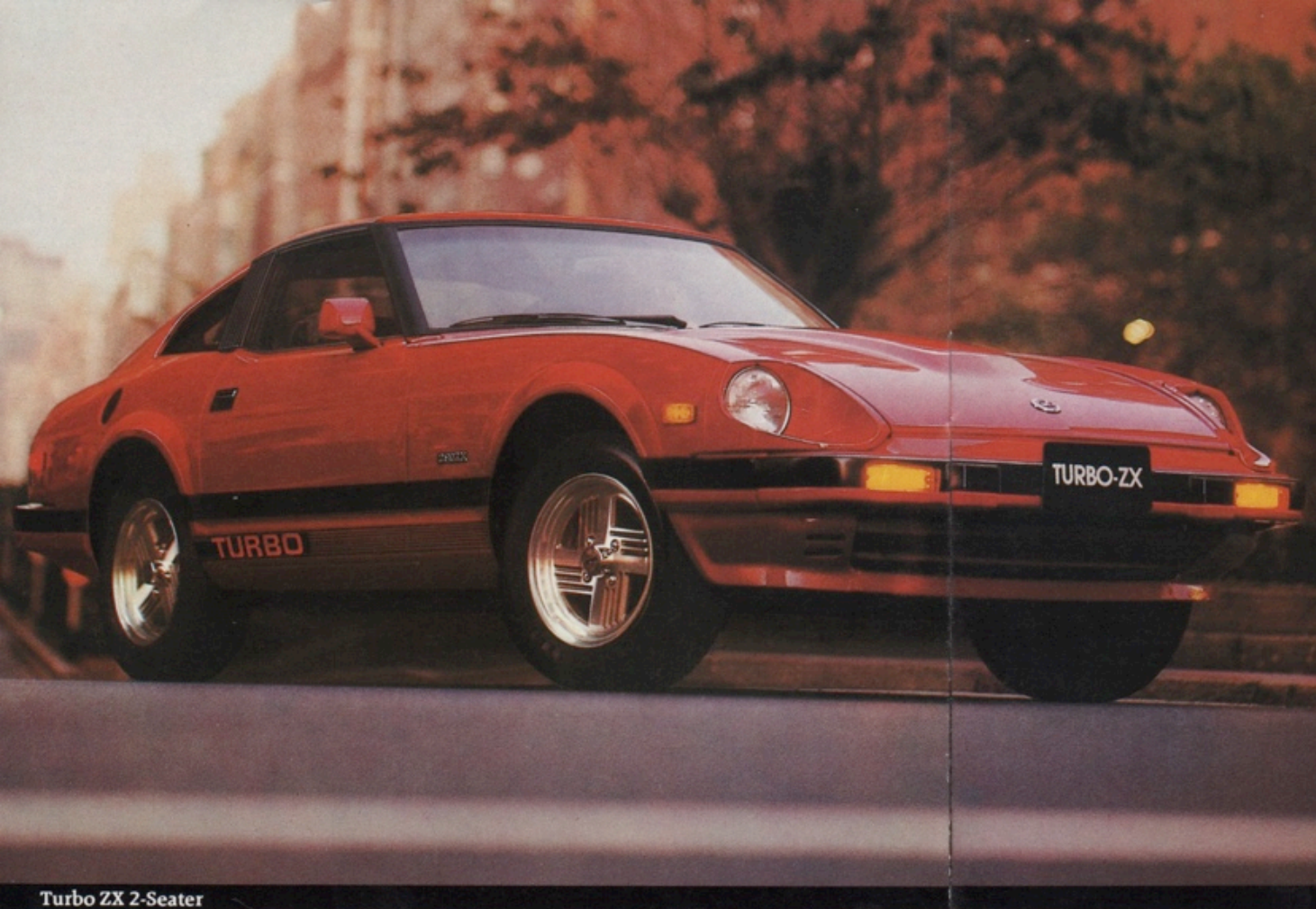
Turbo ZX 2-Seater