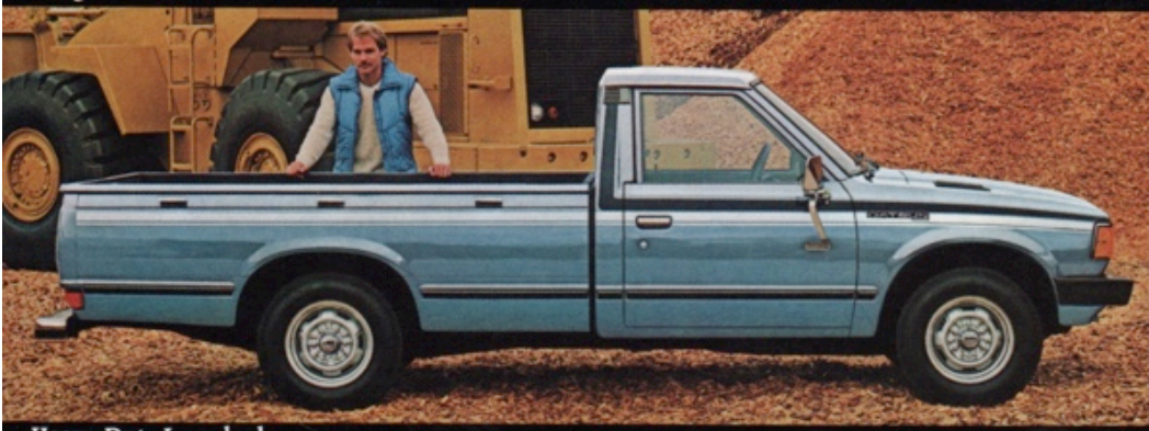
Heavy Duty Long bed