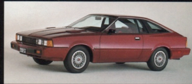
200-SX Hatchback Deluxe