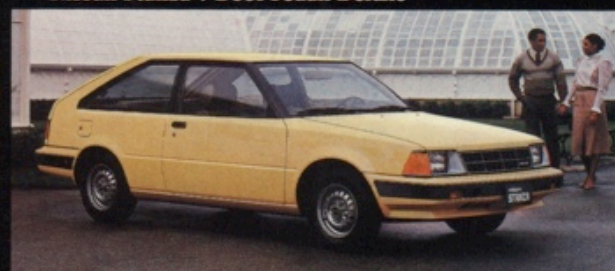
Nissan Stanza 2-Door Sedan Deluxe