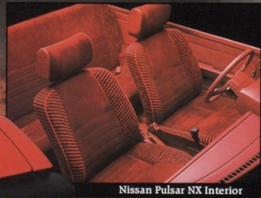
Nissan Pulsar NX Interior