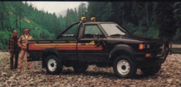
Long bed 4x4