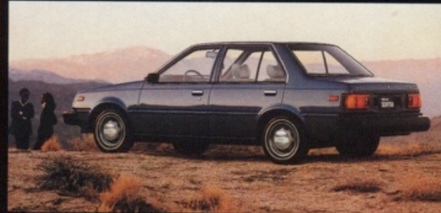
Nissan Sentra 4-Door Sedan Deluxe