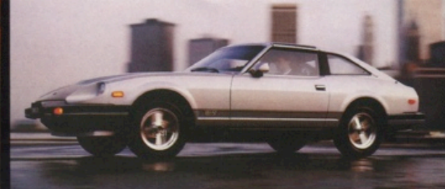
Turbo ZX 2+2